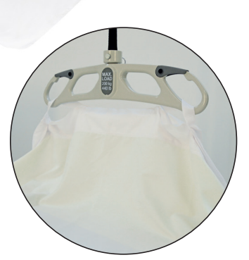
Swift<sup>®</sup> Slider with Handles